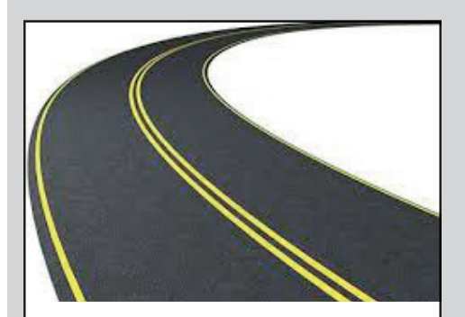
2021 Crack Seal project Total Cost: $39,876.90

Along with the rescheduled Asphalt Paving Program the Township was able to perform the 2022 Chip Seal Program and the 2022 Crack Seal Program. The 2021 Crack Seal Program, which was not able to be completed in 2021 by the contractor, was also completed this year. All three projects have been completed by the contractors. A combined total of $217,622.19 was spent on these projects and are outlined as follows: