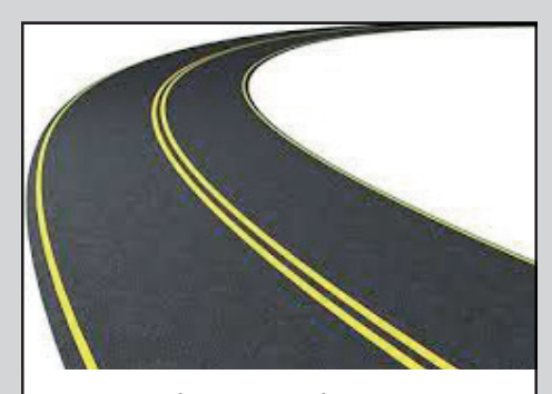
2022 Chip Seal project Total Cost: $153,469.29

Included roads: Richville Dr., Fohl st., Briggle Ave., Lakeside Ave., Parkway St., and a portion of 53rd St.