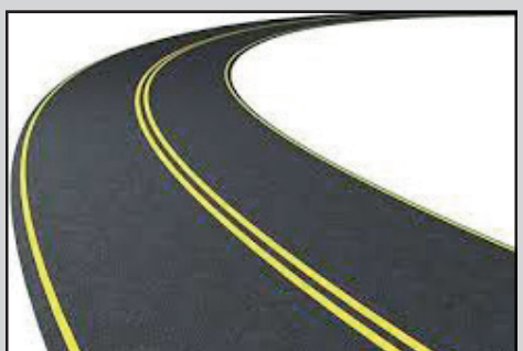
2022 Crack Seal Project Total Cost: $24,276.00

Included roads: Baum, Faircrest SE/SW, Marietta, Keiffer, and a portion of 53rd St.