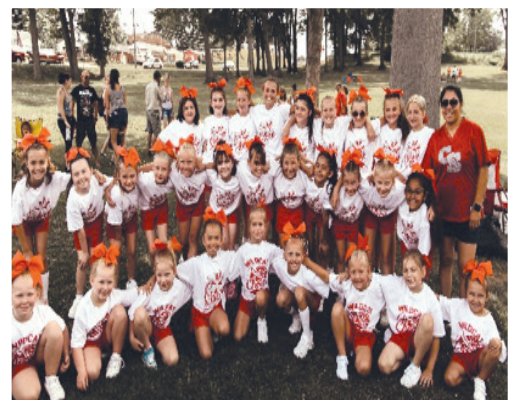
Canton South Youth Cheer