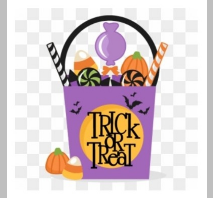
Sunday, October 29th 3pm-5pm