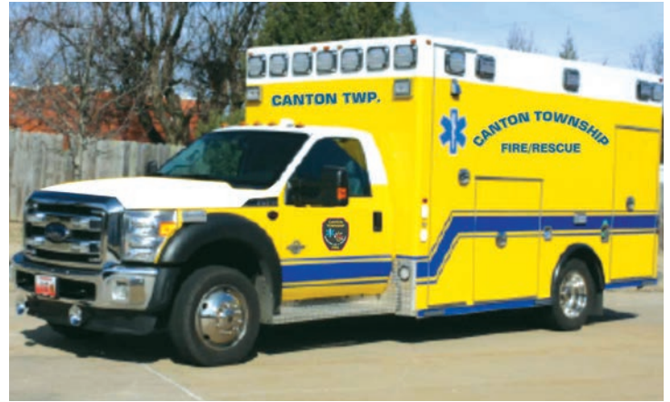
Conceptual rendering of our future ambulances

The ambulances we are replacing were originally purchased in 2002...yes 23 years ago! Three of the units underwent a "re-mount" in 2014. This is when